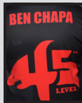
4th Place: 45th Level of Dallas, TX