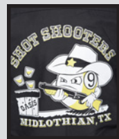
5th Place: Shot Shooters of Midlothian, TX