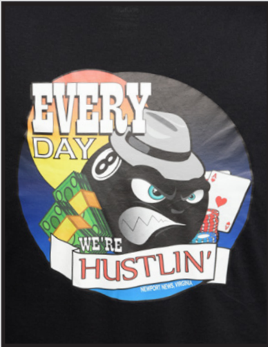
2018 Team Shirt Contest Winners: Everyday We're Hustlin' of Newport News, VA

Shirts may be theme-oriented but may not focus on the World Pool Championships, Westgate Las Vegas Resort & Casino or Las Vegas. Shirts displaying trademarks (e.g., APA logo, Westgate logo, trademarked cartoon characters, etc.), X-rated artwork or violence will be disqualified. APA awarded patches will not disqualify your entry.