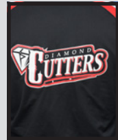
3rd Place: Diamond Cutters of Tacoma, WA