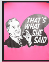
2nd Place: That's What She Said of Lebanon, PA